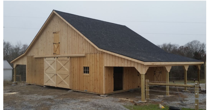
36'x30' High Country Horse Barn Shown With Options