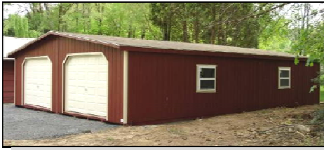
28 x 40 Two-Car Garage - Duratemp Siding (shown with optional insulated house windows & 1ft. gable overhang)