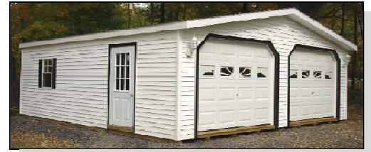
24 x 24 Two-Car Garage - Vinyl Siding (shown with optional 9-lite house door, 1ft. gable overhang, windows w/ decorative inserts in insulated overhead doors, & exterior light fixtures)