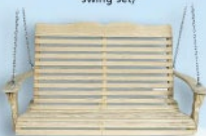
4' Porch Swing (Available with any swing set)