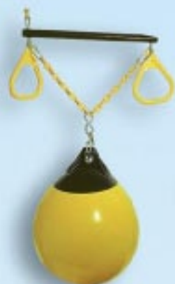
Buoy Ball (with trapeze bar and rings)