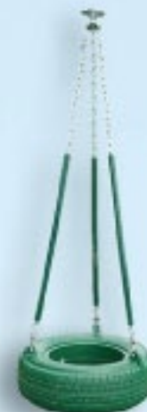
Tire Swing (with hot dog chains) Needs 10' space on top