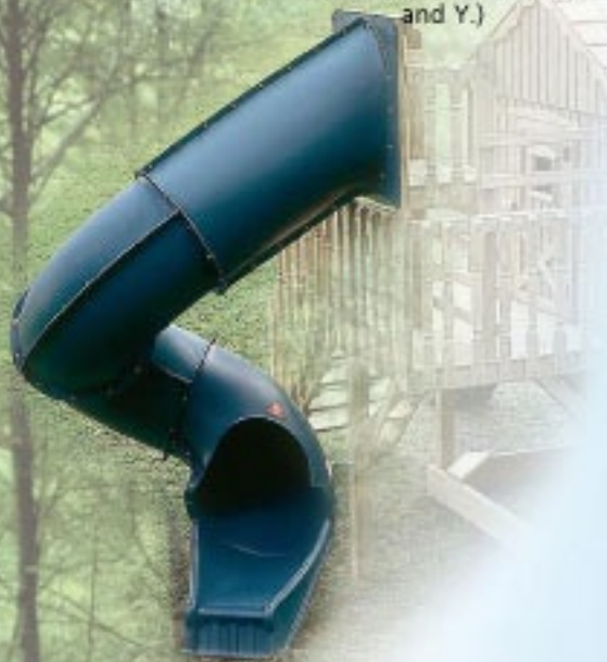
Turbo Tube Slide (Available on Models A, B, C, E, I, J, K, T, U, W, and Y.)