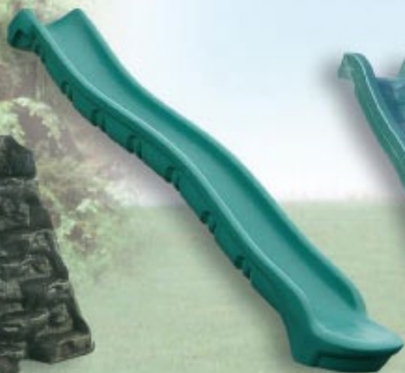
14' Double Wall Super Slide