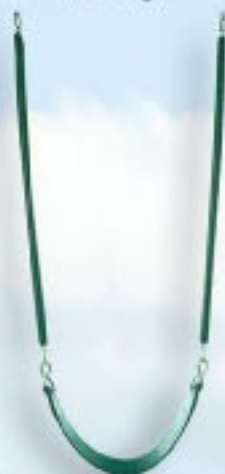
Belt Swing (with hot dog chains)