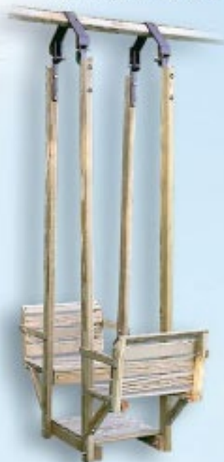
Basket Glider (Available with any swing set except Models I, R, and Y.)