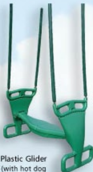
Plastic Glider (with hot dog chains)