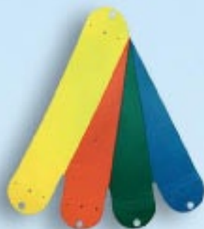
4 Seat Colors