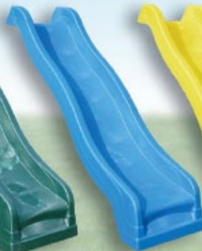
8' and 10' Wave Slides