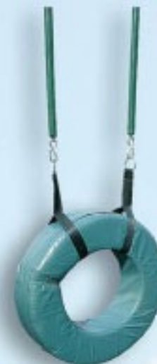
Donut Swing (with hot dog chains)