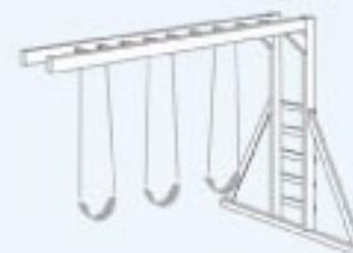
12' (3 Position)