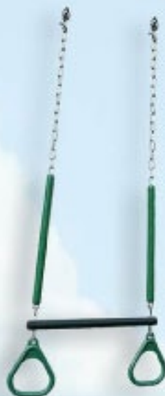
Trapeze (with hot dog chains)