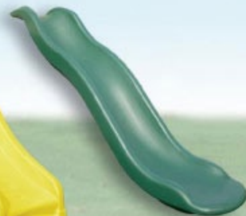
10' Double Wall Rave Slide