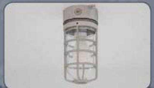
Light with Guard