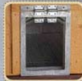
Deluxe Doggie Door