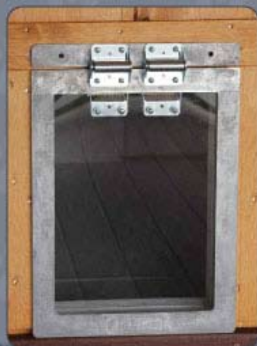
Deluxe Doggie Door