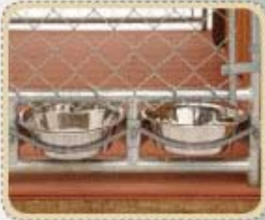
Stainless Steel Feeder Bowls