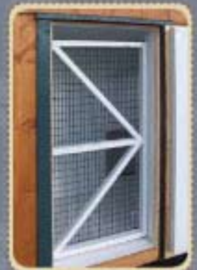
Interior Screen Door