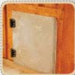
Standard Dog Door